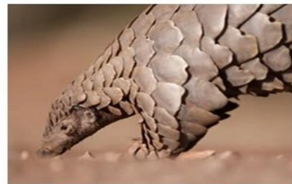
Pictured: Giant pangolin searching for termites.

What animal can curl into a ball and is covered in scales? It's a pangolin! An incredibly rare type of pangolin has been spotted in Senegal, Africa, for the first time in 23 years. The giant pangolin is endangered, which means there are not many of them left. One of the main reasons for this is poaching. Their meat is considered a delicacy in many parts of Asia and Africa and their scales are sought after, so the animals are hunted and trafficked. These adorable animals are easily caught, as their response to danger is to simply curl up and wait, which means they can just be picked