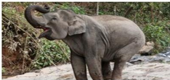
Pictured: Asian Elephant Trumpeting.