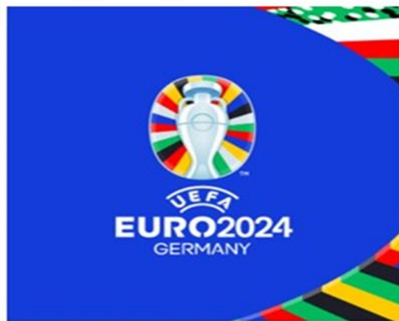
Pictured: Euros 24 logo.

win points. This is the group stage. The top two, or in some cases three, teams in each group will go on to the knockout stage – where only the winner of each match will go on to the next round. The final of the Euros is due to be played in Berlin on 14 th July. Who will you be supporting?